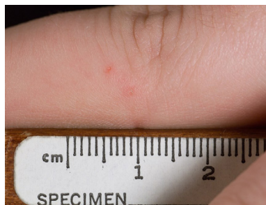
Bite from a bat